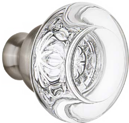
Bordeaux Crystal Knob shown in Satin Nickel